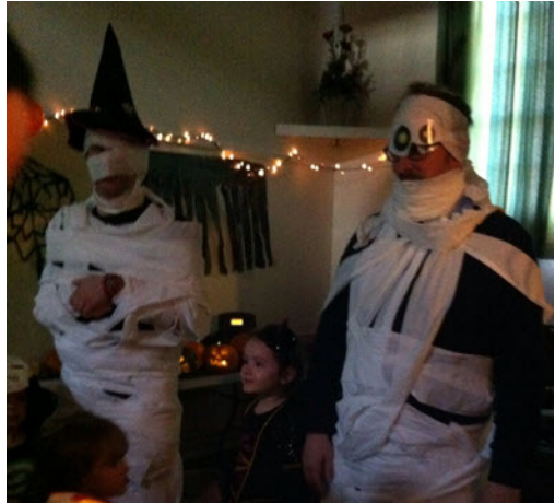
Dads in the "Best Mummy Competition"!

The event was a lot of fun and very well attended, not only by families from Oxhill but also Ettington, Tysoe and Stratford. We hope to see you all on 13th December.